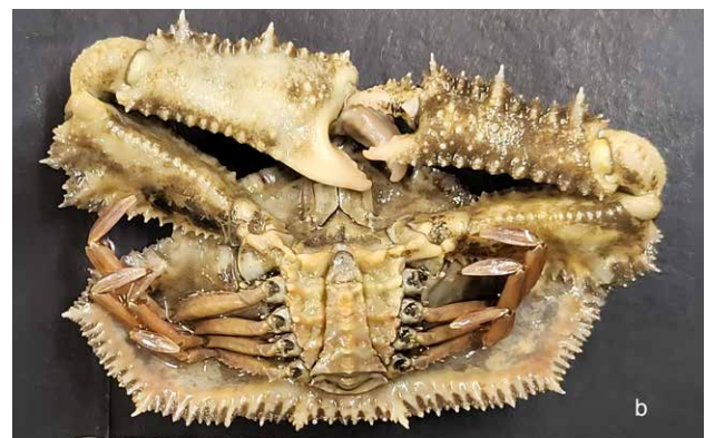
Fig. 2. Cryptopodia angulata a) Dorsal view, b) Ventral view (scale bar = 10 mm)